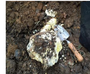
primary source material.

Chromate salts were very patchily distributed in shallow soil, in high density particles ranging in size from boulders to single crystals. Leached secondary deposits, invisible to the eye, were often found to be present in soil below the